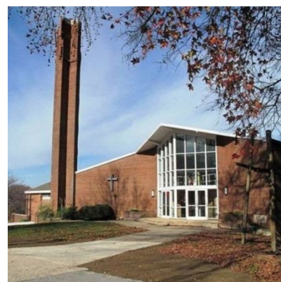
Pennsylvania Avenue Baptist Church located at 3000 Penn Ave SE.

https://www.fivemedicine.com/request-a-appointment.php